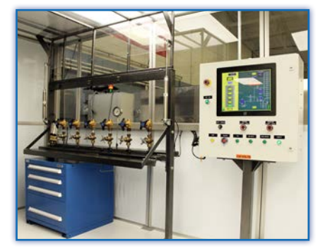
Testing Capabilities up to 9000 PSI